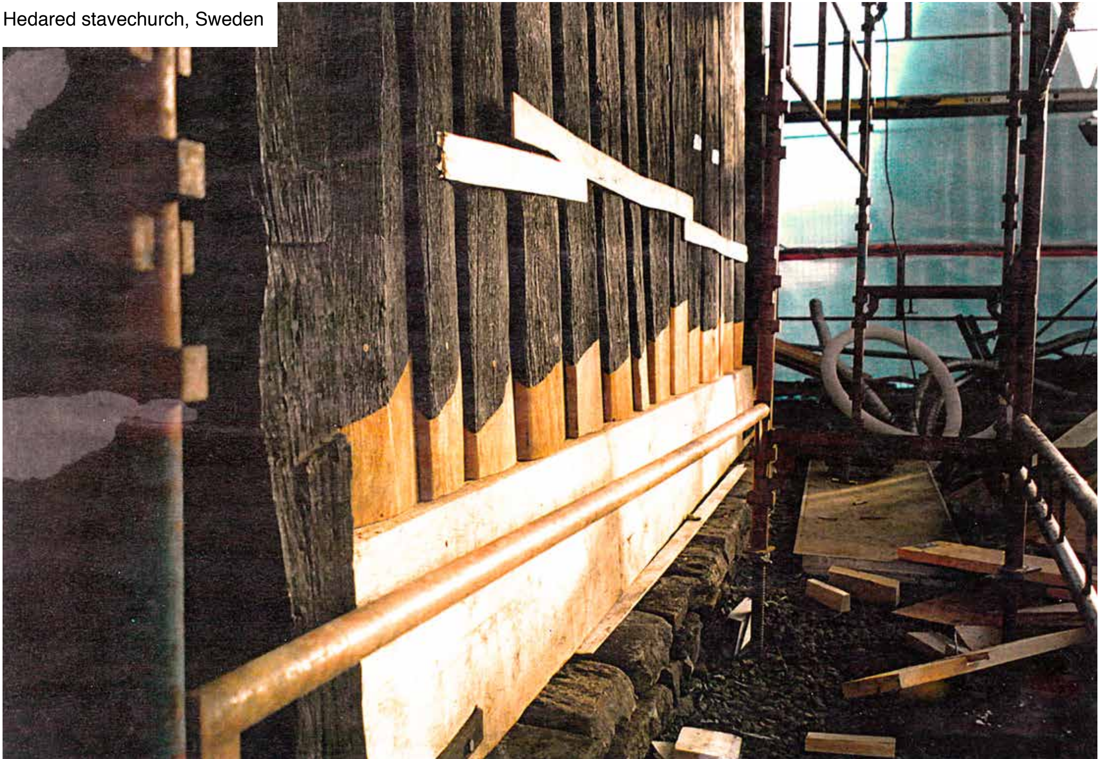
Hedared stavechurch, Sweden